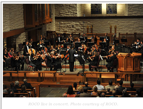
ROCO live in concert.

This unusual orchestra-with-an-unusual-attitude has tended to attract (well, actually, it's more like select) what once would have been considered unusual musicians. The ROCO dream team is made up of people who are first-rate on their chosen instruments, yet who also can augment the company's mission by bringing personality to each concert, as appropriate to the music. In addition, since each musician is sponsored financially by an individual or group, he or she