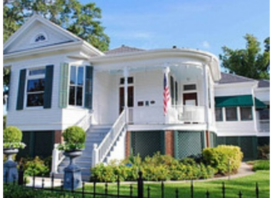
New and shiny isn't always better. In The Heights, it's about keeping it in style with the original spirit of the neighborhood.