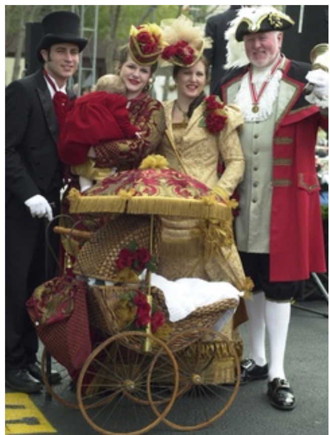
What the Dickens? This festival in Galveston has been going on for 38 years.