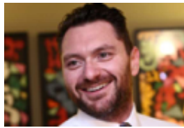
National arts expert to lead Houston alliance