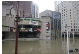
Shades of Allison: Houston Theatre District damaged by flood