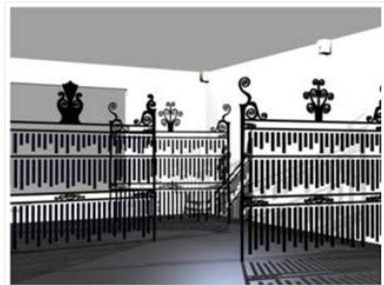
Rendering by Gabriel Craig